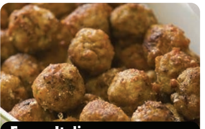
Frozen Italian Meatballs BUY TWO FREE