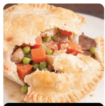
Frozen Pot Pies