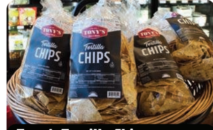
Tony's Tortilla Chips